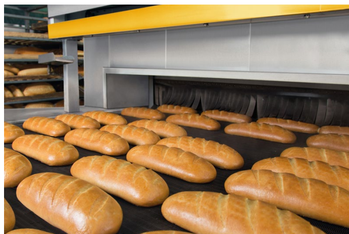
Conveyor chains in bakery ovens are exposed to extreme temperatures upward of 1000°F (537°C), which can significantly challenge typical food-grade lubricants, such as synthetic esters that can evaporate at temperatures above 500-600°F (260-315°C).

In all industries, but particularly in the food industry, it is valuable to understand the makeup of the lubricant that is applied to equipment operating at elevated temperatures.