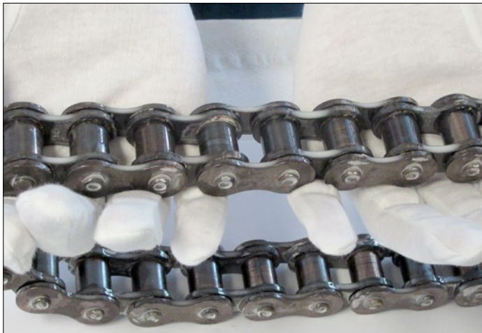
The solid white lubricant formulation (left) of Klüberfood NH1 CH 6-120 SUPREME is NSF H1 registered for incidental contact, providing a food-grade solution for chain lubrication at extreme temperatures without the residue of typical lubricants (right).

To ensure optimum lubrication and performance, Klüberfood NH1 CH 6-120 SUPREME must be properly applied. If a solid lubricant solution has already been used, the same application procedure can be followed. Typically, a solid lubricant in fluid suspension is applied at lower temperatures to reduce smoking and to ensure that the carrier penetrates into the chain components. Application at chain temperatures below 302°F (150°C) is recommended during planned maintenance or periodic downtimes.